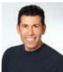
CEO APPA (Australasian Promotional Products Association)

FOR 25 YEARS APPA MEMBERS HAVE SET THE STANDARD FOR CREATIVITY, INTEGRITY AND PROFESSIONALISM IN THE PROMOTIONAL PRODUCTS INDUSTRY.